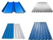
Roof and Wall Panels