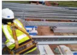
Install the Roof Purlin