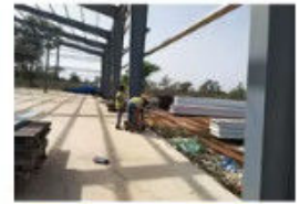
Install the Wall Purlins