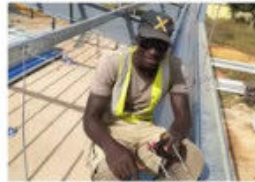
Install the Purlin Rod