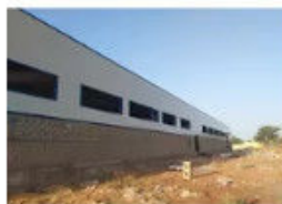
Install the Wall Panels