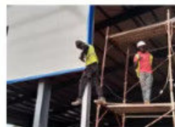
Install the Flasin Sheets