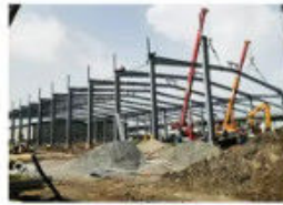
Install the Columns & Beams by Crane