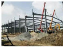
Install the Columns & Beams by Crane