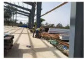
Install the Wall Purlins