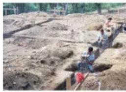
Foundation & Embedded Bolts