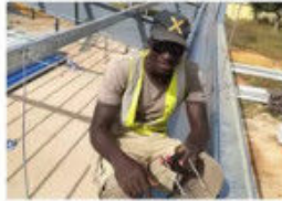
Install the Purlin Rod