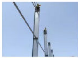
Install the Steel Rod