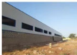
Install the Wall Panels