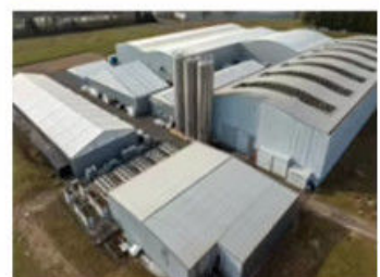
Steel structure livestock house