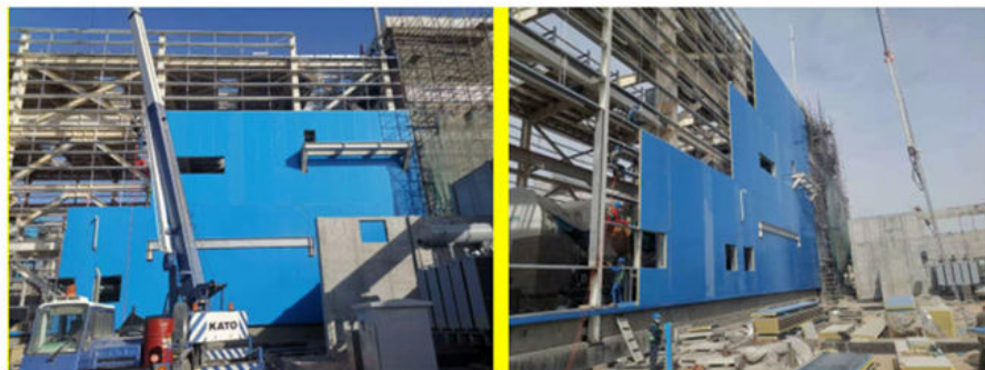
Gas Turbine Combined Cycle Power Station Expansion Project in Basra Iraq