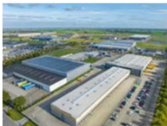
Steel structure warehouse