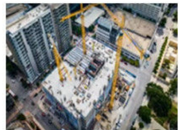
Steel structure building