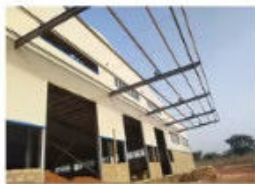
Install the Canopy