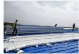
Install the Roof Panels