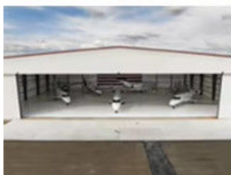
Steel structure garage/hangar