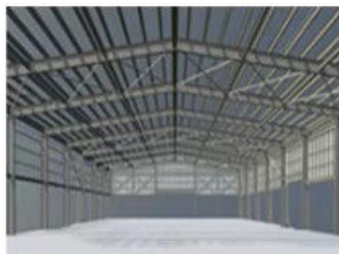
Steel structure factory building