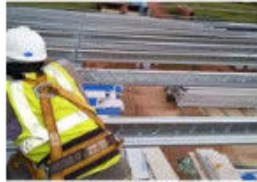
Install the Roof Purlin