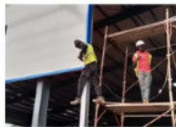
Install the Flasin Sheets