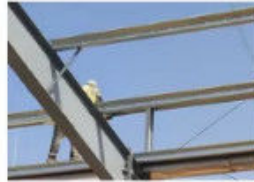
Install the Purlin Bracing