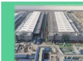
Beijing Daxing Airport Freight Station