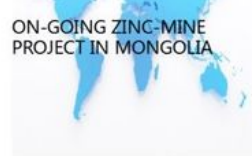
ON-GOING ZINC-MINE PROJECT IN MONGOLIA