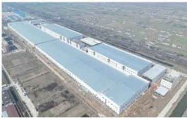
China SVOLT COMPANY PROJECT-LITHIUM BATTERY WORKSHOP OF GREAT WALL MOTOR CO.