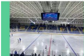
Mongolian Steppe Arena Roof and Sound-absorbing Panel for Inside