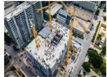
Steel structure building