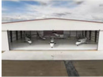
Steel structure garage/hangar