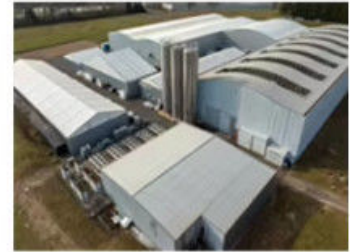
Steel structure livestock house