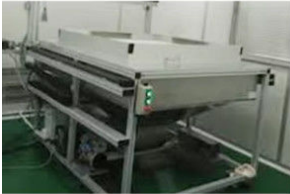
Automatic PAO Testing Platform