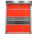
PVC Rolling Door