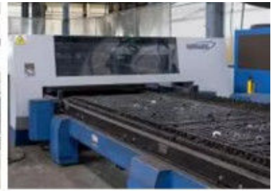
Filter Media Pleating Machine