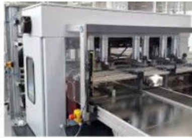
Filter Media Pleating Machine