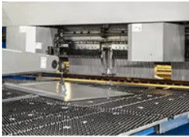
Digital Bending Machine