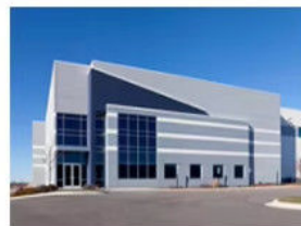
Steel structure house