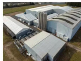
Steel structure livestock house

Product Application Occasions and Scenarios for BAODU Steel Warehouse: