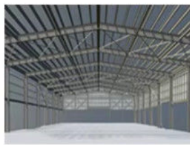
Steel structure factory building