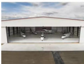
Steel structure garage/hangar