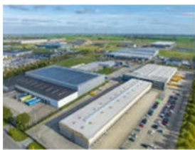
Steel structure warehouse