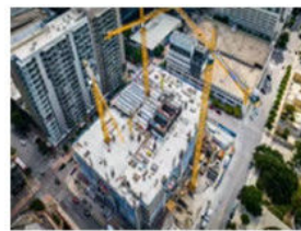
Steel structure building