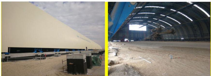
Clean Coal Fired Power Plant Phase I (4x600mw net) Project in Hazyan Dubai