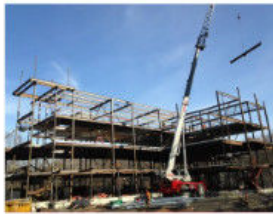
MULTI-STOREY BUILDING IN PHILIPPINES