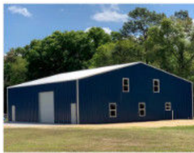
PREFABRICATED SHED IN CANADA