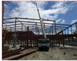
SHOPPING MALL IN PHILIPPINES