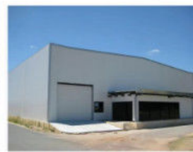
METAL WORKSHOP IN INDONESIA

Product Application Occasions and Scenarios for BAODU Steel Warehouse: