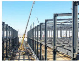
HEAVY WORKSHOP IN AUSTRALIA