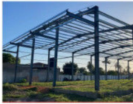
STEEL BUILDING IN ZIMBABWE