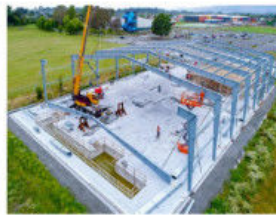
PREFAB WAREHOUSE IN CANADA