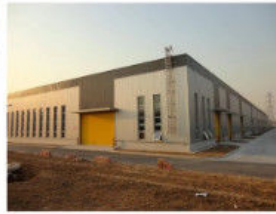
FACTORY WAREHOUSE IN MALAWI