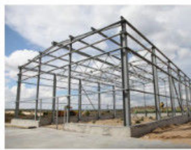
STEEL WAREHOUSE IN GERMANY