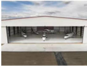
Steel structure garage/hangar