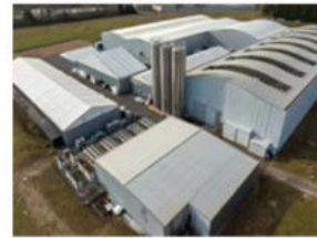
Steel structure livestock house

The Steel Warehouse can be used for different applications, including warehouse, workshop, hangar, hall, and other steel structure needs. Its gable frame Steel Structure design makes it fire-resistant and provides a high level of safety for the goods and equipment inside.