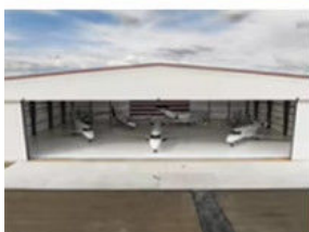
Steel structure garage/hangar