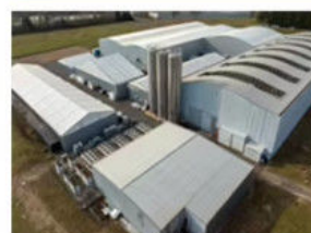
Steel structure livestock house

The Steel Warehouse by BAODU is a versatile building that can be used for multiple applications. It is perfect for storage purposes as it is spacious and has a high load-bearing capacity. It is also suitable for use as an industrial steel workshop, hangar, or hall. The building can be customized according to the user's needs and requirements, and it comes with different door options such as sliding door, rolling door, shutter single door, and color steel.