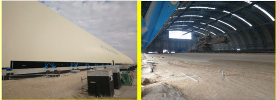
Clean Coal Fired Power Plant Phase I (4x600mw net) Project in Hasyan Dubai