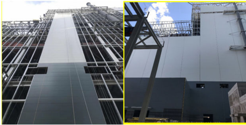
2 * 1000MW Supercritical Power Plant Phase III Expansion Project in China