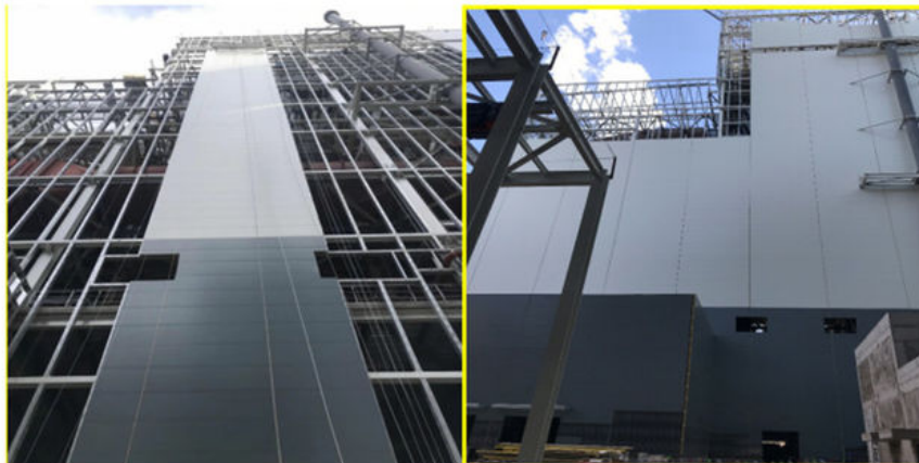
2 * 1000MW Supercritical Power Plant Phase III Expansion Project in China