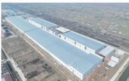
China SVOLT COMPANY PROJECT-LITHIUM BATTERY WORKSHOP OF GREAT WALL MOTOR CO.