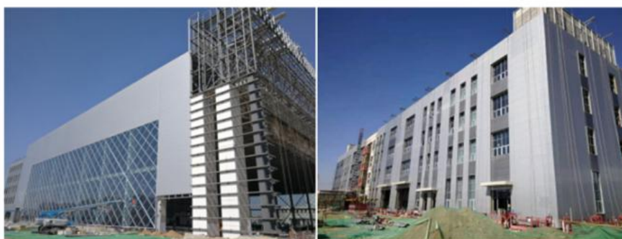
East Airlines Maintenance Area of Beijing New Airport