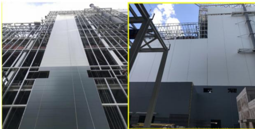
2 * 1000MW Supercritical Power Plant Phase III Expansion Project in China